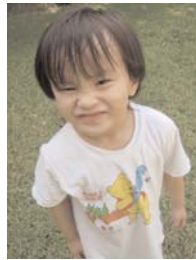
Nemo Mar.2008, May2008