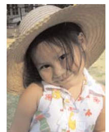
Palm Oct.2007, Apr.2008