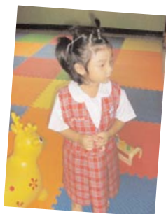
Donut happily visiting CCCM